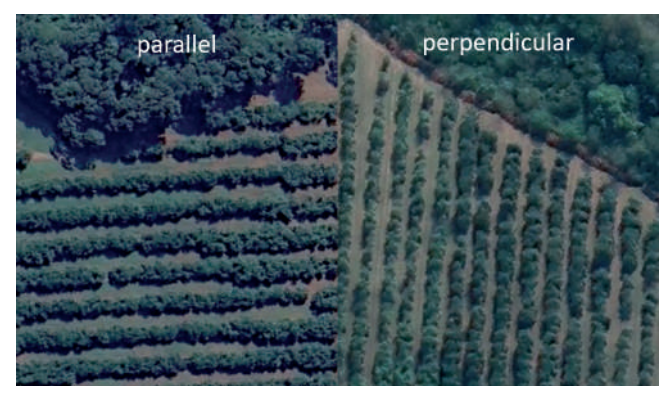
Figure 2. Examples of macadamia tree rows oriented parallel or perpendicular to the edge of the natural habitat.

The study strongly emphasizes the importance of pollination services for successful macadamia nut production. Through thoughtful orchard planning and utilizing the natural landscape surrounding the orchards, we can increase nut production without additional agricultural inputs. This research highlights the potential for ecological intensification through these smart design choices and the preservation of natural habitats. Recognizing the essential role of pollinators and introducing design measures that support their work not only boosts nut production but also contributes to the conservation of vital natural habitats. This approach is an important step towards a more sustainable and environmentally conscious future for agriculture.