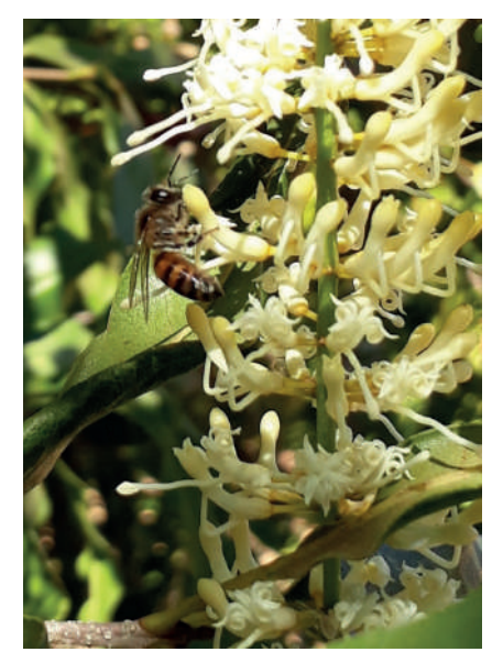
Figure 1. Honeybee drinking nectar from a macadamia flower.

Equal Opportunities Officer of the Faculty of Agricultural Sciences. Deputy Director of the Hans-Ruthenberg Institute for Tropical Agricultural Sciences.